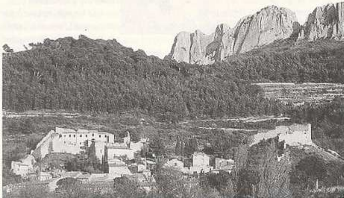
Rising above Gigondas is the rugged outcropping known as the Dentelles de Montmirail. From a distance the rocky spurs look rather like teeth, leading many visitors to assume that that is how they got their name (dents in French means teeth). Dentelle, however, means lace, and these mountains were named for what the local populace insists is their lacy look.